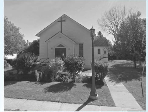
St. Andrew, Sackets Harbor